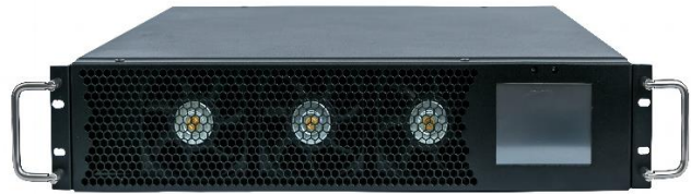
Rack Mounted (WP-FR)