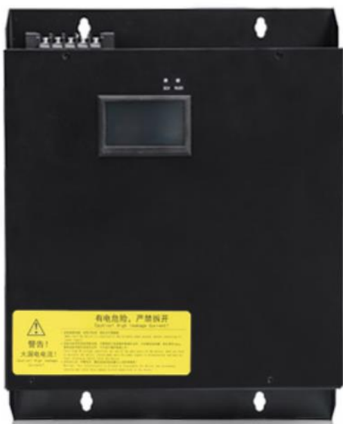
Wall Mounted (WP-FW)